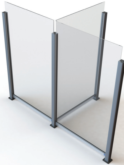
Terrace 75 cross-section